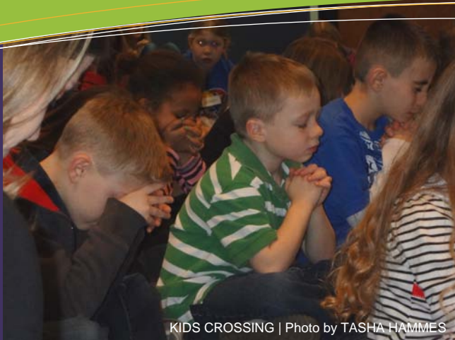
KIDS CROSSING